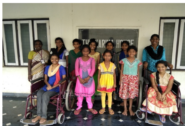
Children at Home