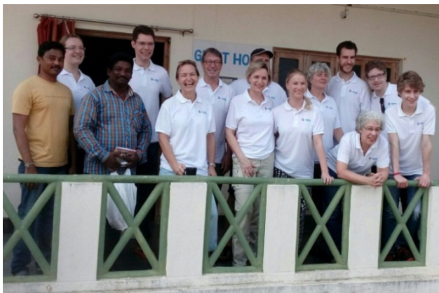
The AGP Team I 2017