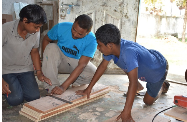
Youngsters learning Carpentry work