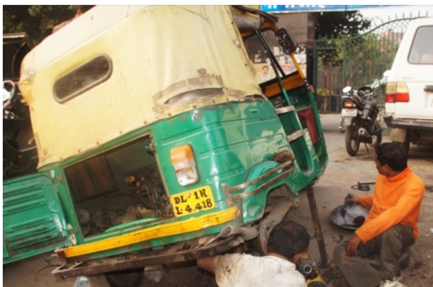
Tuk tuk work shop and repairs