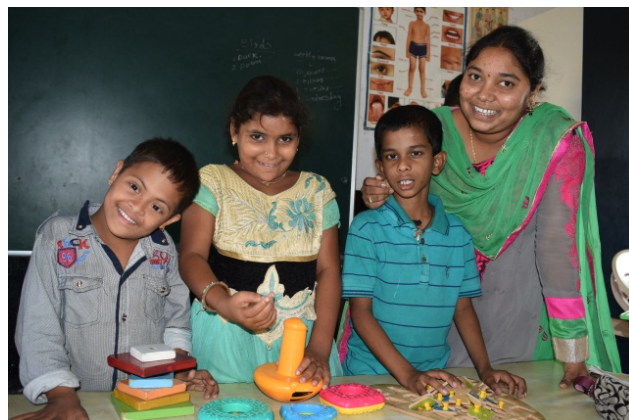
Children at ADL Training center

Campus also has Special Education, under the responsibility of the English Medium School. There are 3 teachers specially trained for the following children: