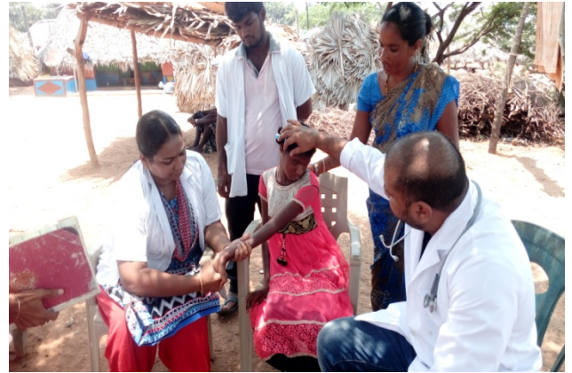
Physiotherapy follow up at Outreach

In 2017, 40 campus children and 160 persons from outreach, in total 200 persons are attending for physiotherapy at Campus itself. Also the medical team along with physiotherapist visits the villages once in a week to give physiotherapy at home. It is vital that children continue to do the exercises and the parents and their relatives also encourage them to do the physiotherapy at their home. Therefore, a booklet has been made for the parents, which includes pictures of all the exercises.