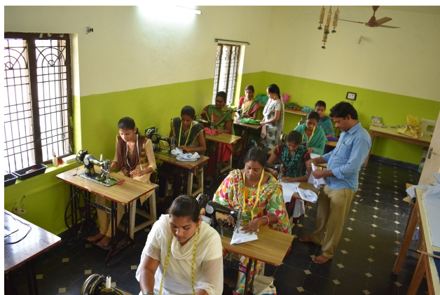
Youth girls at Stitching center

Our aim is to train the differently able youngsters in basic foundation courses like MS Office, Desktop publishing etc. During the year 2017, 9 differently abled youngsters have been trained in ICT and some of them got opportunities in nearby Industries.