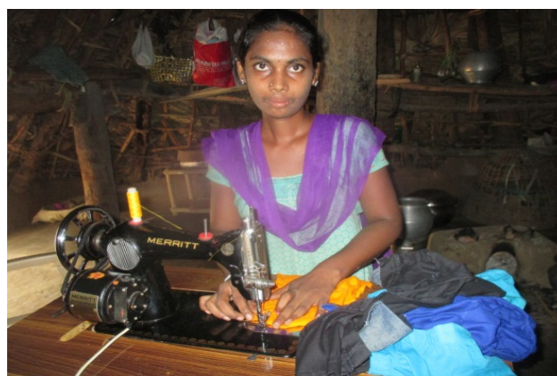
Youngster self employed at her village