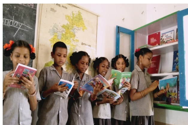
Children while using English Libraries