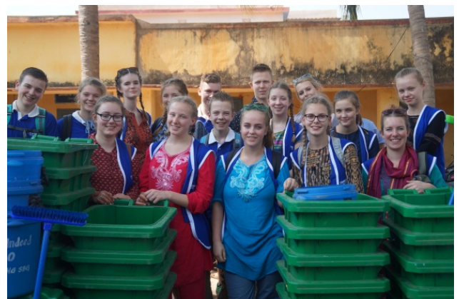
The Corlaer College team II 2017