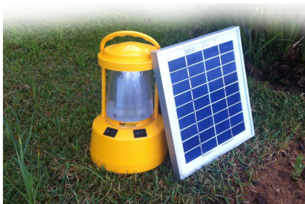
Portable solar panel and lanterns