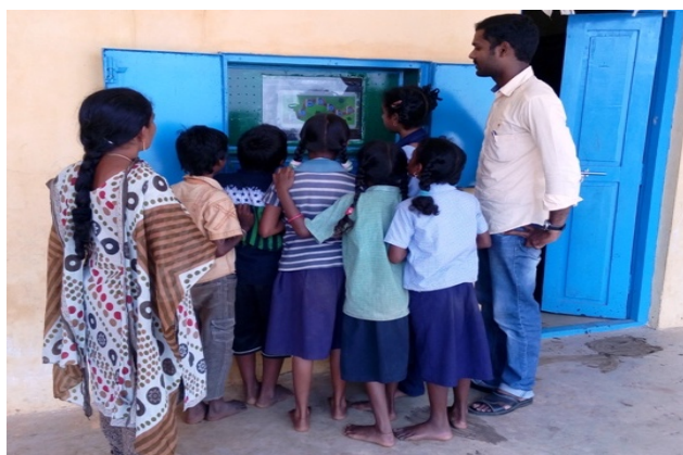
Children while using Child Tuition Software