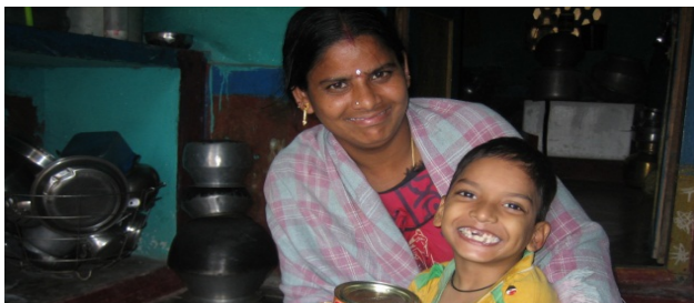
Aurobindo Pharma Foundation distributed wheelchairs for Outreach children and youth

The Outreach program is taking care of 850 children living inside the villages and is the backbone of