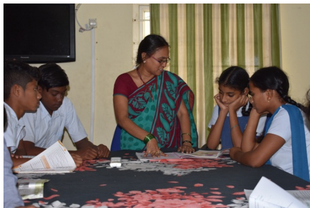
Children at School Library