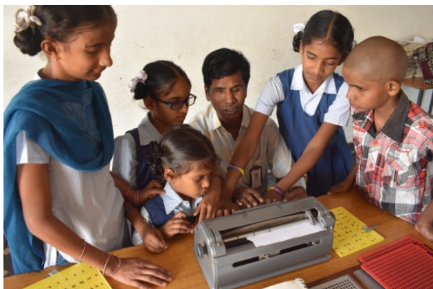
Children at Special class room