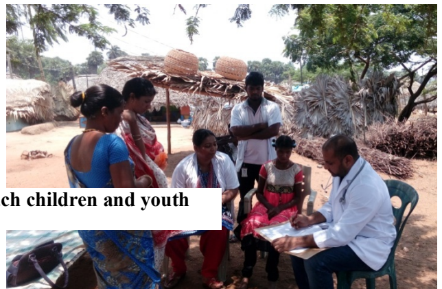
Doctor and Physiotherapy follow up at Outreach villages

our program. The children all belong to Fishing and Tribal communities.