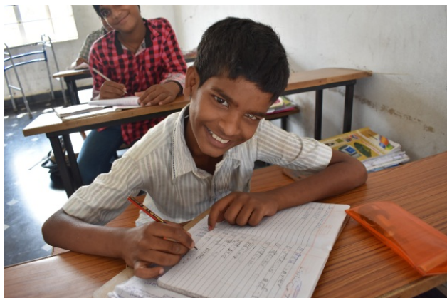
Children at Class rooms