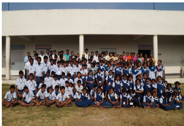
Children at School